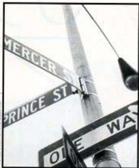
Address: Earth.com/earth.com, Inc.