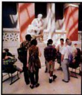
of 1991

to Gramercy Park-area colleges like the American Academy of Dramatic Arts. Benny's Burritos are considered worth traveling for; their delicious, but impossible-to-finish bur-