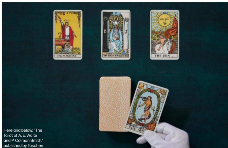
Here and below: "The Tarot of A. E. Waite and P. Colman Smith," published by Taschen